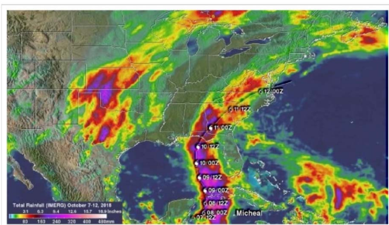
Total Rainfall from October 7 to 12 (NASA)

Source: https://blogs.nasa.gov/hurricanes/2018/10/15/michael-2018-3/